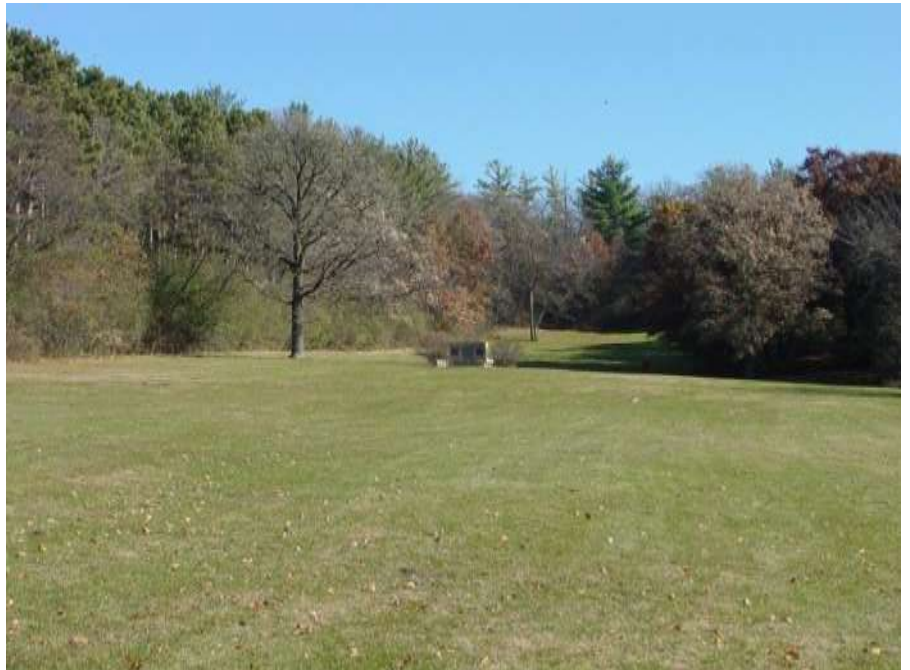
Rochester State Hospital Cemetery

The land used for the cemetery was purchased in 1886. This was the second cemetery to be used by the Rochester State Hospital. The exact location of the first cemetery is unknown, but it was likely to the southeast of the monument, which can be seen near the middle of the cemetery. The people buried in the cemetery were patients at the State Hospital. The 2,019 gravesites are carefully platted and the location of each individual grave meticulously recorded. Originally the male patients were buried south and the female patients north of the road which went down the center of the cemetery. This segregation ended in 1940, when the first female was buried south of the road. The gravesites were then filled in sequence without regard to the sex of the deceased until the last burial in 1965. Most of the original gravestones were removed due to vandalism or for safety reasons.