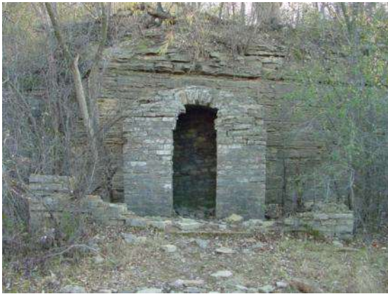
Cap Shack (right)

The cap shack was constructed for safety purposes. It was designed to store the dynamite blasting caps in an area away from the dynamite sticks. The shack itself was made of cement and had a small iron door. What is left of the cap shack is located against the east wall of the quarry floor.