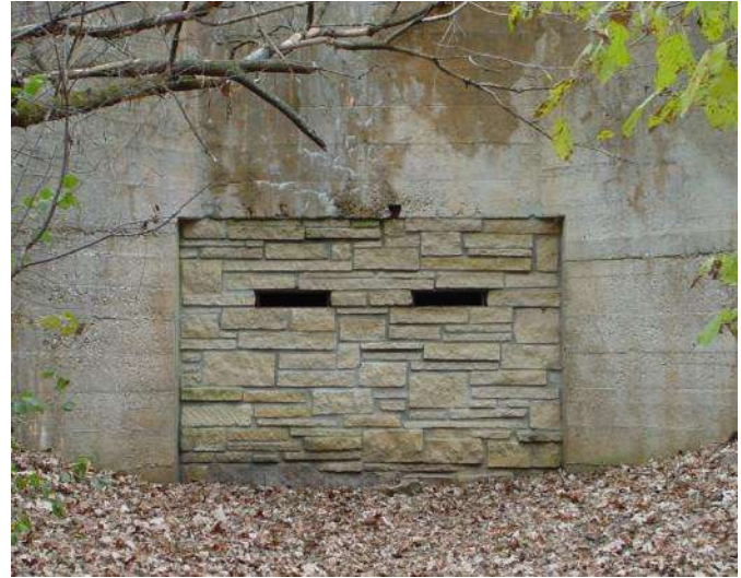
Middle Cave Entrance (right)