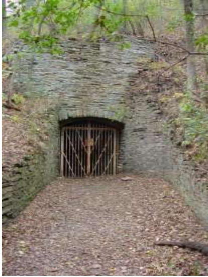
Current Cave Entrance (left)

In 1990 the second and third entrances of the cave were closed to protect the natural beauty of the cave. Limestone walls seal off these two entrances, with small rectangular openings left to allow for the passage of animals that reside in the caves. These animals may include cave crickets, wintering bats, spiders, and phoebes, a summer resident bird. An iron door that can be opened for cave tours closes off the main entrance.