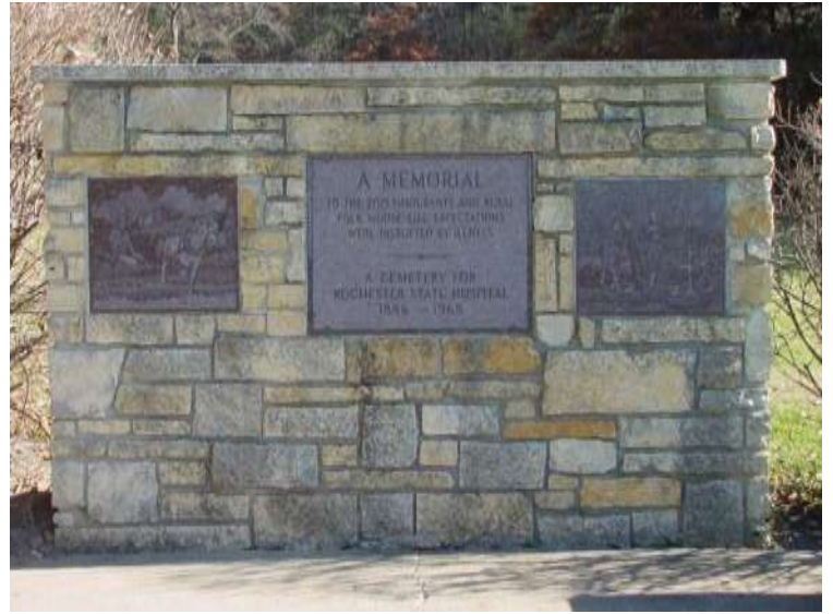
Rochester State Hospital Cemetery Memorial

A recent effort to revitalize the cemetery has resulted in new headstones being placed as well as new landscaping.