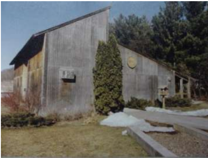
Nature Center in 1989