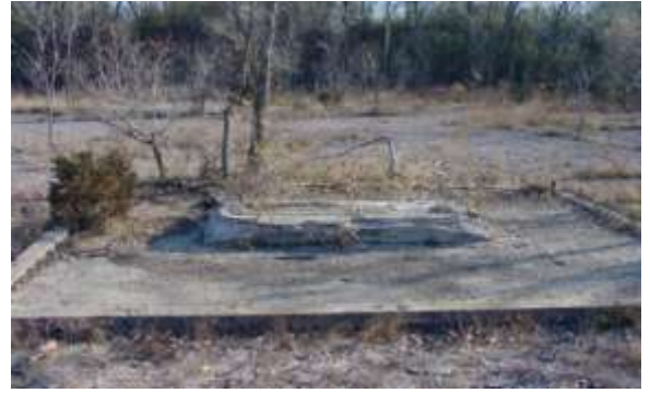
Compressor Base (right)

The compressor was used to run the quarrying equipment and to pump out water that ran into the quarry when it rained. All that remains of the compressor now is the base, located in the southeast end of the quarry.