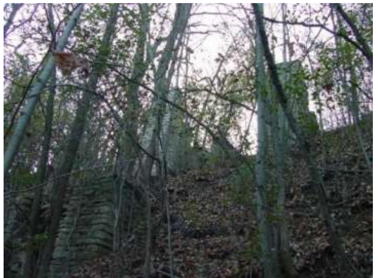
Rock Crusher Towers

In 1900 the state appropriated $800 to buy a rock crusher. This enabled the quarry to provide crushed rock that was used as a gravel substitute for improving roads. Another rock crusher was added in 1912 to meet the increased demand for crushed rock by local contractors, as well as increased use by the Hospital. Saint Mary's Hospital, the Kahler Hotel, and the 1928 Plummer Building are among those built with materials from this site. In 1934 a pulverizer was added to meet the need for limestone dust by farmers. Rock prices were quite a bargain: crushed rock for $1.25/yard and limestone dust at $.75 a ton.