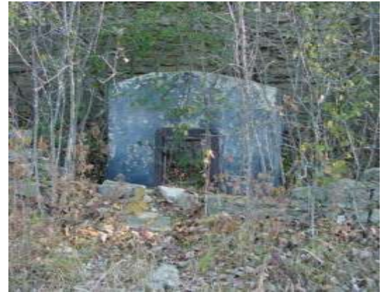
Dynamite Shack (left)