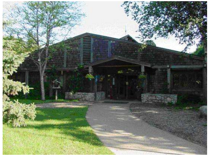
Nature Center in 2002